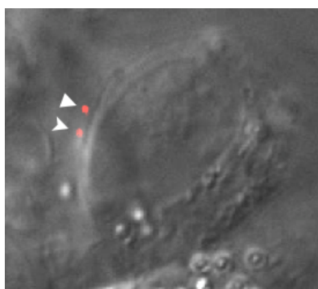
Figure 1. (Top) Schematic drawing of the dual-fluorescence microscopy setup used for virus tracking. (Bot) Trafficking of a single Den virus particle labeled with DiD in a live cell (arrow head and triangle) during 30 second time interval.

because of the involvement of multiple entry pathways and multiple steps on each pathway, each featuring dynamic interactions of the viruses with different cellular structures. By real-time fluorescence imaging microscopy, we have selected Dengue (Den) virus, one of most significant human viral pathogens globally, especially in tropical areas, as a study model to investigate the mechanism of viral infection and the trafficking pathways of single virus particles in living cells. Den virus was concentrated by ultracentrifugation, labelled with lipophilic dye DiD and purified through gel filtration columns. Fluorescent viral image was observed by an inverted microscopy (IX 71, Olympus, Japan) which is equipped with a set of dual channel box (U-SIP, Japan) and high sensitivity CCD (CoolSNAP HQ2, Photometrics, USA). For fluorescent images were recording by exciting DiD with a 633 nm helium-neon laser, and mCherry with a 532 nm PSS laser. The laser beams were directly guided to specimen by reflected mirrors. The different excited fluorescence signals were separated in dual channel box before CCD sensing. Different time-lapsed fluorescence images from virus, cell organisms were merged with DIC image, and these real time images allow us to monitor the dynamics interaction between single virus and host cells.